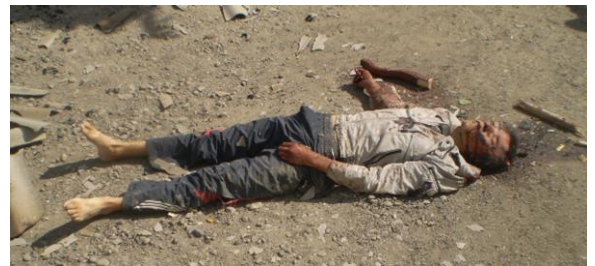
Photograph: the murdered resident of Osh.

The same modus operandi of the headquarters prevailed in other cities, including Dzhalal-Abad, Nookat, Suzak, etc. The information about the victims recorded by departments was sent to the Ministry of Public Health, and to the commandant's office of these cities. Based on the received information, authorities determined the provision of medications and humanitarian help, trying to ensure its even distribution.