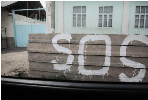
Osh, June 12, 2010

According to official data, prior to the events of April 2010, ethnic Uzbeks made up approximately 14.7% of the population of Southern Kyrgyzstan, while according to independent sources – up to 30 %. Most of them were urban residents.