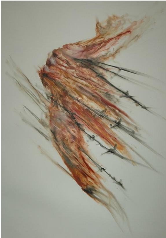
Victim's Breakthrough, 2011 Author: Sergey Ignatyev

or any form of indecent assault.” 9 However, rape and sexual harassment were not included into the list of serious crimes under this Convention, required to be addressed by states in courts. Similar formulations are included in two additional protocols of the Convention regarding protection of victims of international and internal armed conflicts adopted in 1977. 10